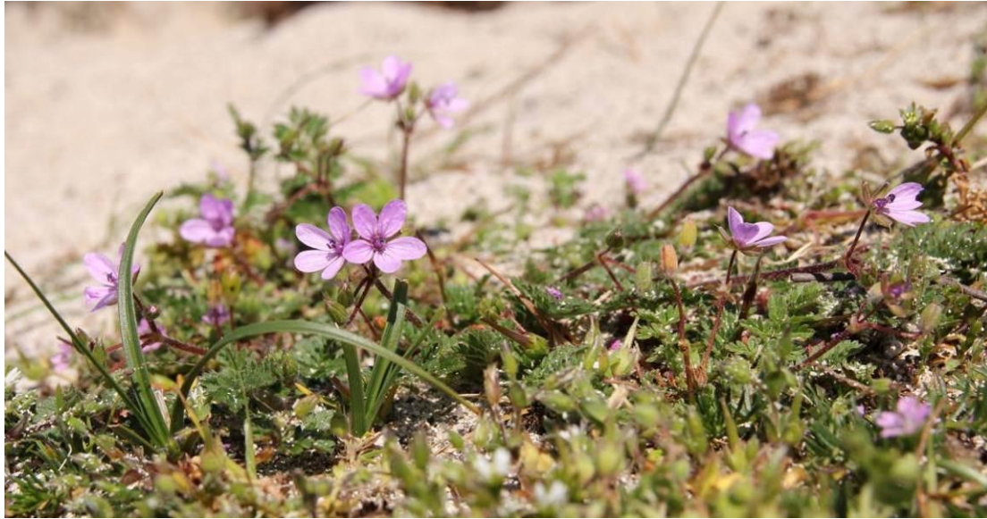
Common stork's-bill Erodium cicutarium on Iona