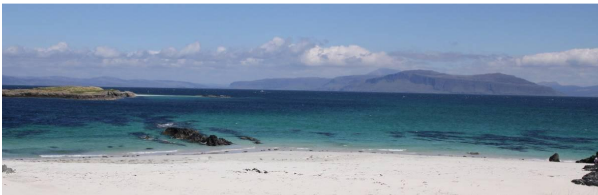
The northern beaches of Iona

Noted on the 22 nd during the trip to Staffa and Lunga. A small group were also seen on Iona on the 24 th and near the saltmarsh at Dervaig on the 25 th .