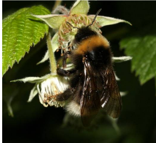
Bombus bohemicus Gypsy cuckoo bumblebee female Tobermory (Nick Owens)