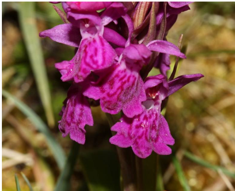
Dactylorhiza purpurella Northern marsh orchid Calgary beach (Nick Owens)