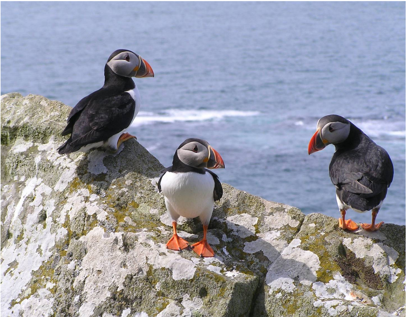
Puffins on Lunga